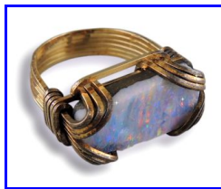
Ring with Opal