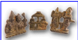
Figures From India