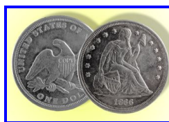
1866 Silver Dollar Copy