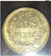
1945 Mexican Dos Pesos valued at $75 +/-