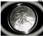
2007 American Eagle one oz Silver uncirculated coin