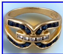
18 Kt Ring-Diamonds and Sapphires