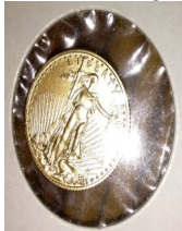
1/10 GOLD EAGLE VALUED AT $165 +/-