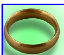
18 Kt Band