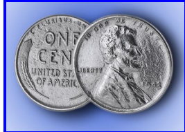
1943 Steel Penny