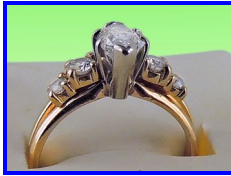
14 Kt Ring and Diamonds