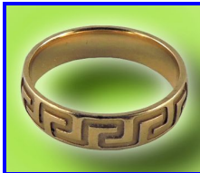
Tungsten Spinner Ring