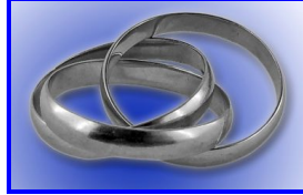
14 Kt White Gold Band