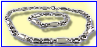
Stainless Steel Chain