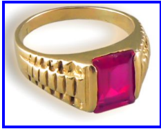
10 Kt Ring