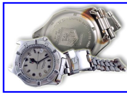
Tag Heuer Watch