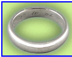
18 Kt White Gold Band