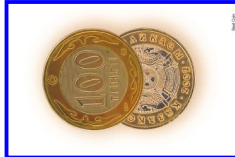
2002 Foreign Coin