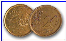
1999 Spanish Coi