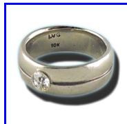
White Gold with Diamond