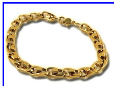
Bracelet with Stones