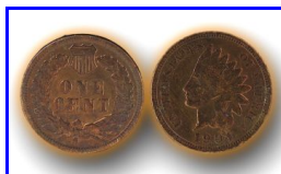
Indian Head Penny 1901