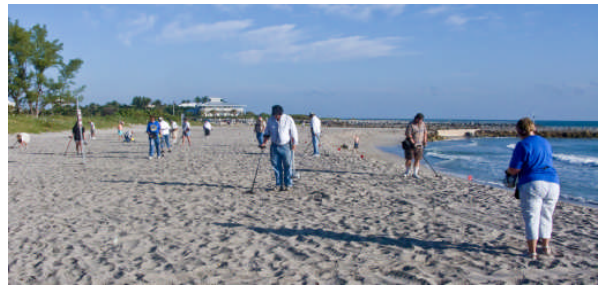
Large Hunt Field