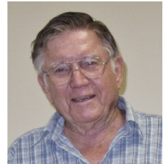
Bob Smirnow Diamond Ring 10/08 Gold Toe Ring 10/08