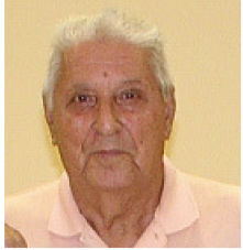
Carmelo Baslico Gold Bracelet 7/08