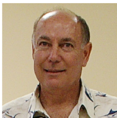
Frank Nash Platinum Diamond Toe Ring 5/08 Wedding Ring 11/08 Engagement Ring 11/08