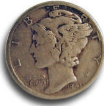
OLDEST DIME 1943 JIM SHARP