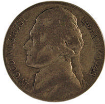
OLDEST NICKEL 1943 JIM SHARP