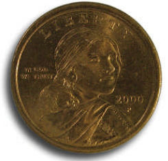
OLDEST DOLLAR 2000 JIM SHARP