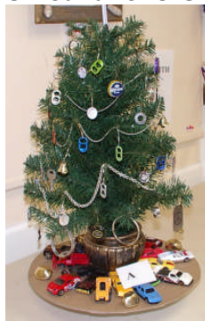
MOST CREATIVE ROTATING TREE KEN LUBINSKI