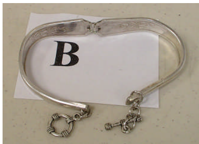
MOST UNUSUAL BRACELET FROM SPOONS JIM SHARP