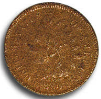
OLDEST PENNY 1880 IRVING SMITH