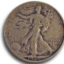
OLDEST HALF DOLLAR 1940 BOB SMIRNOW