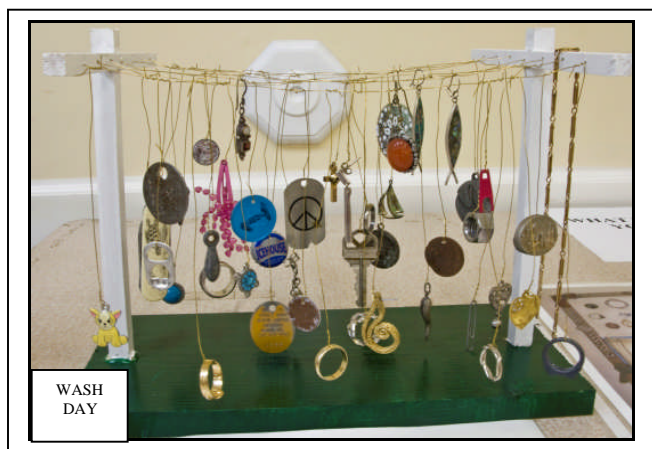
MOST UNUSUAL Ken Lubinski

Received a certificate and silver bar for their creative efforts!