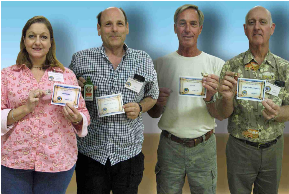
Monthly Best Finds Winners