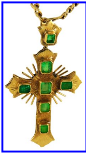
18 Kt Cross