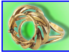
14 Kt Ring