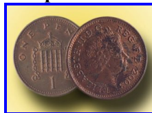
2003 Foreign Coin