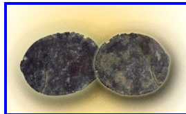
Railroad Flattened Coin