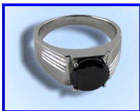
Stainless Steel Ring