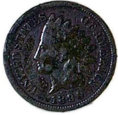
OLDEST PENNY 1890 LINDA BENNETT