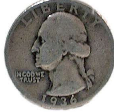
OLDEST QUARTER 1936 JIM SHARP