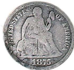
OLDEST AMERICAN COIN IRVING SMITH