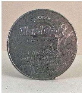
BEST TOKEN BOB SMIRNOW