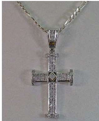
BEST SILVER – STACEY deLUCIA