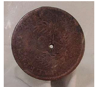
BEST FOREIGN COIN IRVING SMITH