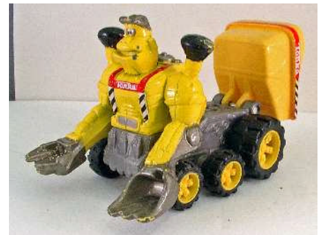
BEST TOY – BOB SMIRNOW