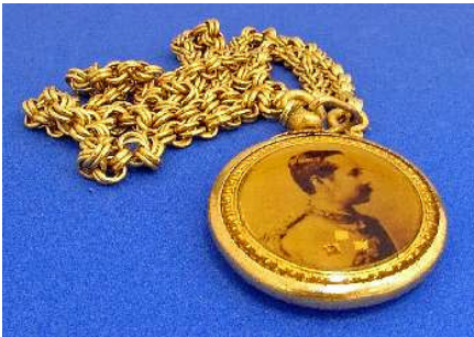
BEST GOLD – IRVING SMITH