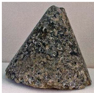
MOST UNUSUAL CHERYL PETENBRINK