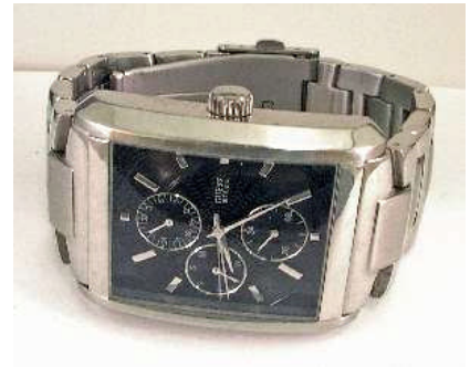
BEST COSTUME-BOB SMIRNOW