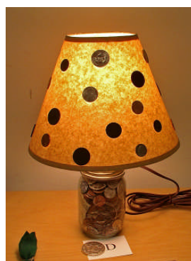
MOST CREATIVE-GAIL HOSKINS