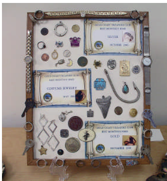
BEST DISPLAY-KEN LUBINSKI