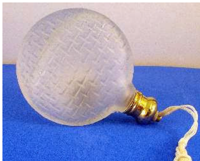
BEST NONJEWELRY CHERYL PETENBRINK