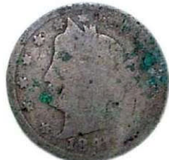
OLDEST NICKEL 1891 IRVING SMITH