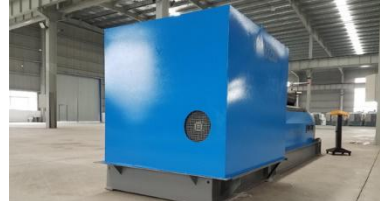
Left side of the rolling machine