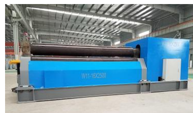
Back view of the rolling machine