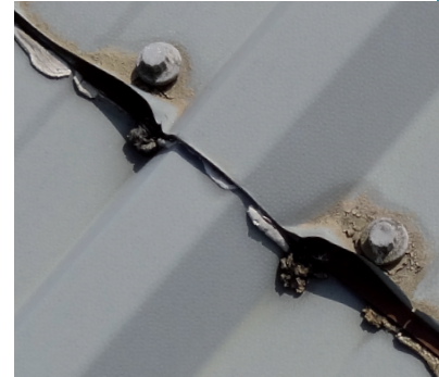
Cut edge corrosion

The Tor EdgeProtect™ system provides a cost effective means of tackling cut edge corrosion. It seals and safeguards corroded edges and mechanical fixings to leave the roof watertight.