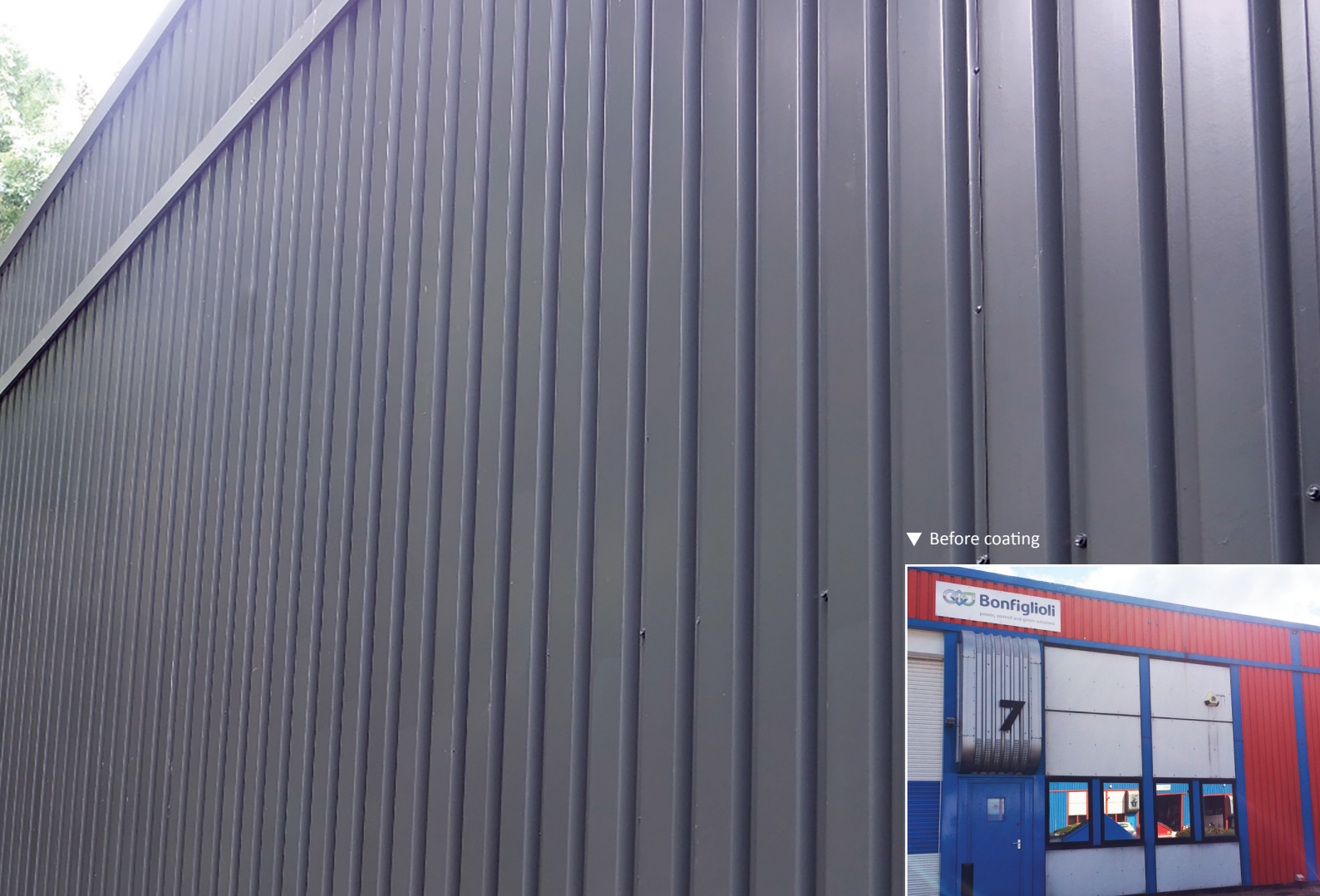
▼ Before coating