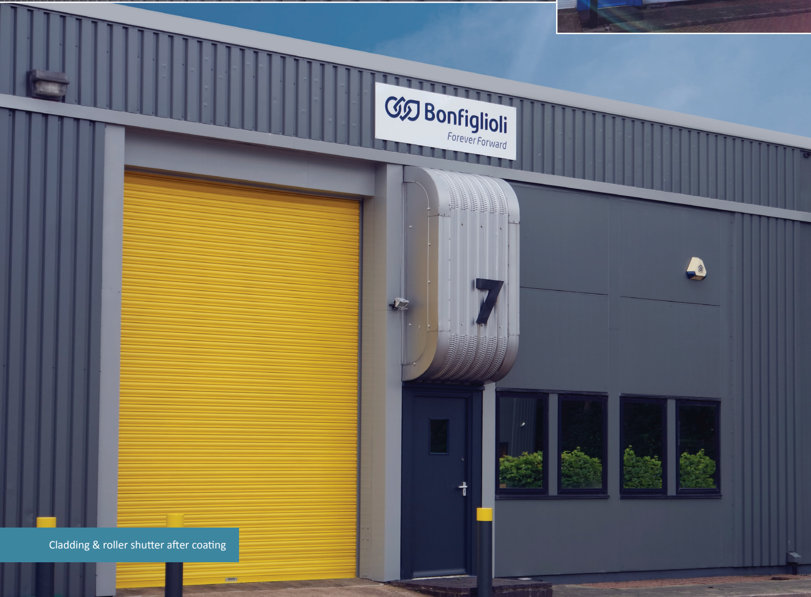
Cladding & roller shutter after coating