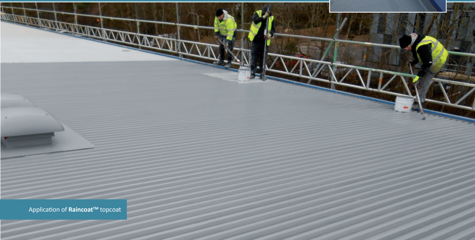
Application of Raincoat™ topcoat