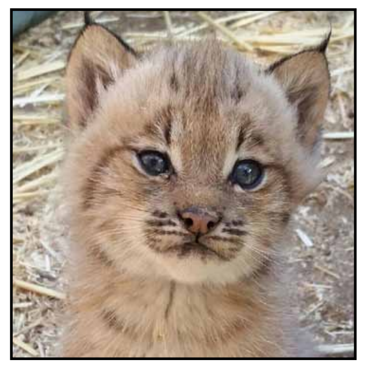
Baby Lynx, (Lynx Canadensis), Whiskey (male) and Bailey (female)born at the Heritage Park Zoological Sanctuary. Their parents, Memphis and Foxy, both seven years old, have resided at the sanctuary since 2013, on loan from another animal organization.