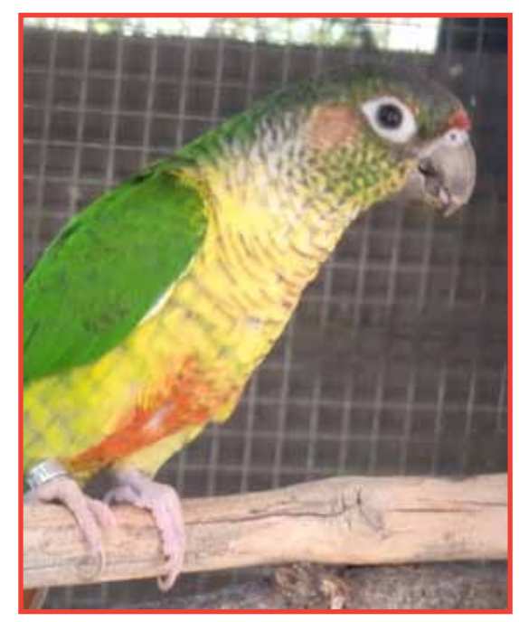
Conure, Demitri, passed away October 2017.