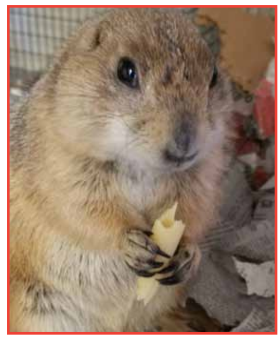
Valentine, Prairie Dog, came to us in 2014. He passed away in September 2017.