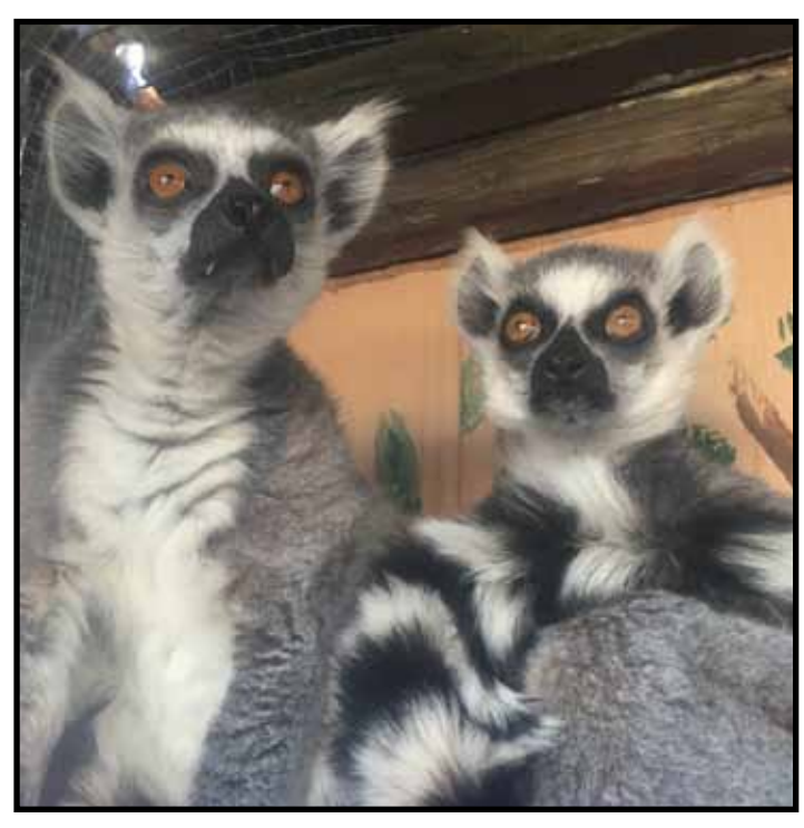
Ring Tailed Lemurs, (Lemur catta) Zabu 11 year old male and 11 year old Female