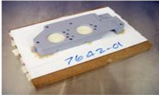
Step 1: SLA Master