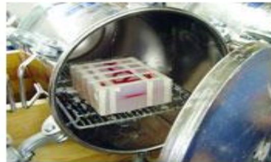
Step 4: Autoclave