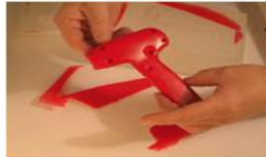
Step 6: Clean flash off part