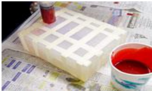
Step 3: Cast urethane