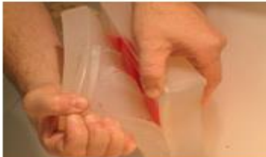
Step 5: Demold part