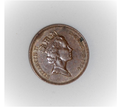
Best Coin 1994 Two Pence Kevin Bean