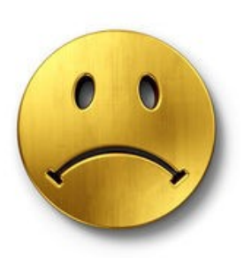
Best Gold With Stone No Entry