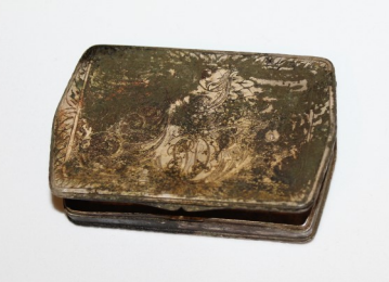
Best Silver Women's Powder Holder James Perkins III