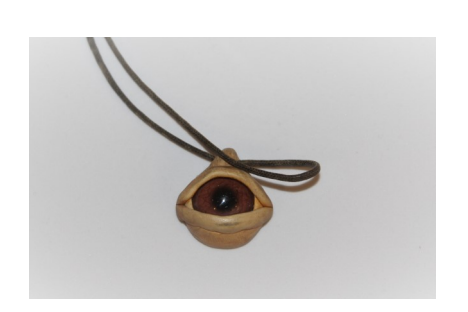
Most Unusual "Evil" Eye Ed Morin