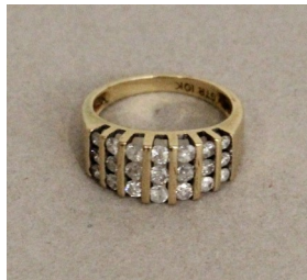
Best Gold W/Stone April Sovich