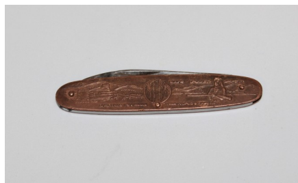
Most Unusual Arnie Steiner