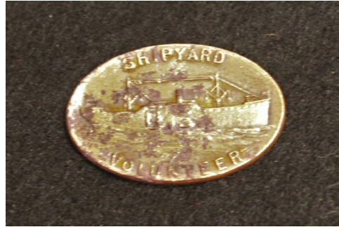
Most Unusual WWI Shipyard Volunteer Pin Arnie Steiner