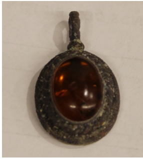
Best Silver Earring with Stone April Sovich