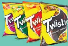
Twisties Chips Assorted 65g BUY 3 @ RM5 00