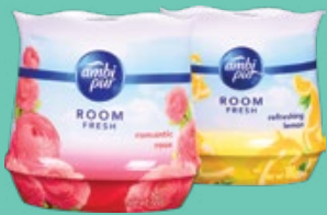
Ambi Pur Gel Assorted 180g