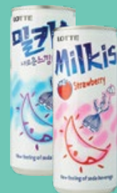
Lotte Milk Drinks Assorted 175g - 250g BUY 5 @ RM10 00