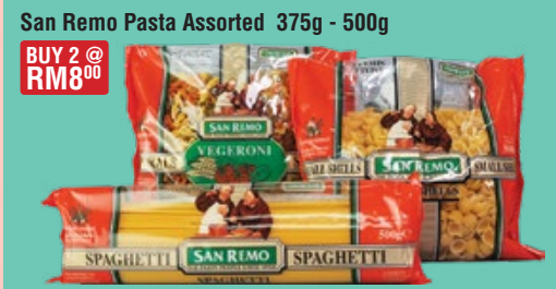
San Remo Pasta Assorted 375g - 500g BUY 2 @ RM8 00