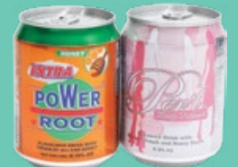
Power Root Drinks Assorted 6x250ml BUY 2 @ RM26 00