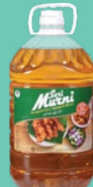
Seri Murni Cooking Oil 5kg BUY 2 @ RM34 00