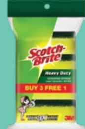
Scotch Brite Scouring Sponge 3+1