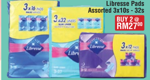
Libresse Pads Assorted 3x10s - 32s