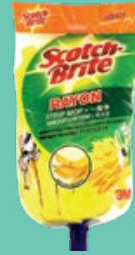
Scotch Brite Absorption Mop