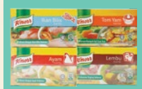
Knorr Cube Assorted 60g BUY 2 @ RM5 00