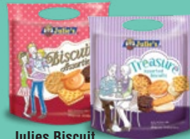
Julies Biscuit Assorties/Treasure Biscuit Assorted 285g BUY 2 @ RM10 00