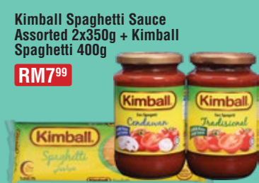
Kimball Spaghetti Sauce Assorted 2x350g + Kimball Spaghetti 400g RM7 99