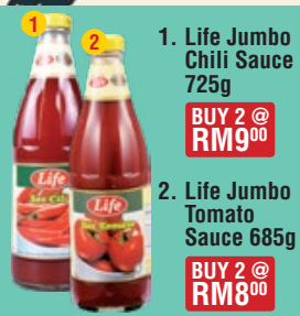
1. Life Jumbo Chili Sauce 725g BUY 2 @ RM9 00 2. Life Jumbo Tomato Sauce 685g BUY 2 @ RM8 00