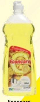
Econcare Dishwash Liquid Assorted 900ml