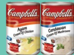
Campbell's Cream Soup Assorted 290g - 305g BUY 2 @ RM8 00