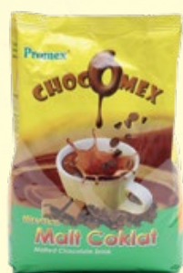
Promex Chocomex 900g