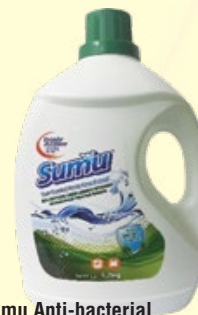
Sumu Anti-bacterial Liquid Laundry Detergent 4.7kg