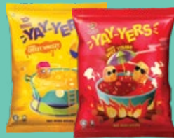
Mister Potato Yayers Spicy Tebabo/Cheazy Wheezy 60g BUY 2 @ RM5 00