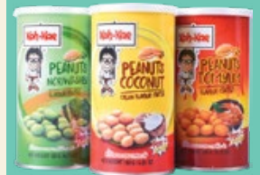
Koh-Kae Peanut Assorted 180g BUY 2 @ RM14 00