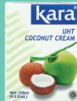
Kara Coconut Cream 200ml BUY 2 @ RM5 00