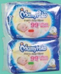
Mamypoko Baby Wipes Assorted 160s