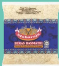
Maharaja Basmathi Rice 1kg BUY 2 @ RM19 00