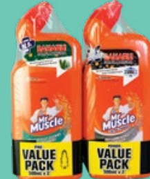
Mr Muscle Toilet Cleaner Assorted 2x500ml