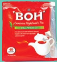
Boh Tea Potbags 40s 100g BUY 2 @ RM9 00