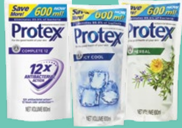
Protex Shower Cream Assorted 600ml