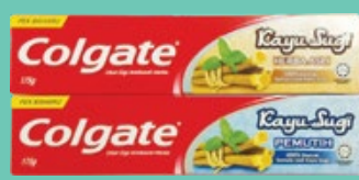
Colgate Kayu Sugi Toothpaste Assorted 175g