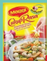
Maggi Cukup Rasa All in 1 300g BUY 2 @ RM10 00