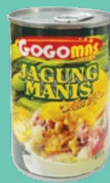
Gogomas Cream Corn 425g BUY 2 @ RM4 00