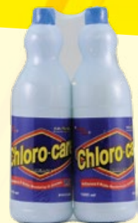
Chloro-Care Bleach Assorted 2x1000ml