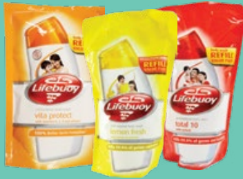
Lifebuoy Body Wash Assorted 850ml