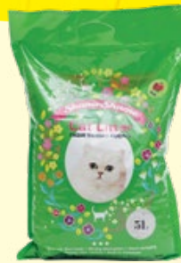
Shame Shame Cat Litter Assorted 5L