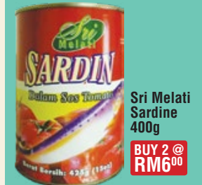
Sri Melati Sardine 400g BUY 2 @ RM6 00