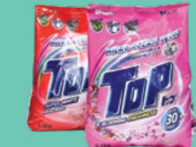
Top Powder Assorted 2.1kg - 2.3kg