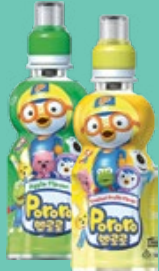
Paldo Pororo Assorted 220ml - 235ml BUY 3 @ RM10 00