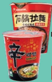
Nongshim Cup Noodles Assorted 70g - 72g BUY 3 @ RM10 00