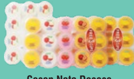
Cocon Nata Decoco Pudding Assorted 12x80g BUY 2 @ RM20 00