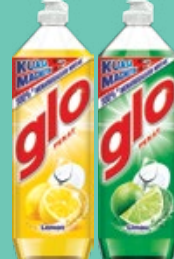
Glo Liquid Dish Wash Assorted 900ml