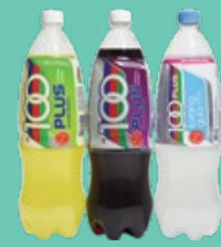
100 Plus Assorted 1.5L BUY 2 @ RM6 00