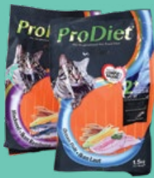
Prodiat Cat Food Assorted 1.25kg - 1.5kg