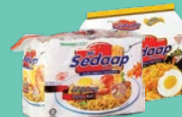
Sedaap Mie Goreng Assorted 5x88g - 91g BUY 2 @ RM7 00