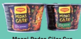
Maggi Pedas Giler Cup Noodles Assorted 97g - 98g BUY 2 @ RM6 00