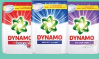
Dynamo Powder Assorted 3.3kg - 3.6kg