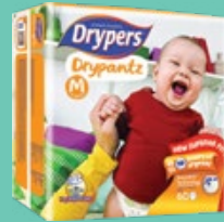
Drypers Drypantz S82/ M60/ L48/ XL42/ XXL36