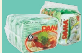
Pama Noodles Assorted 5x55g BUY 2 @ RM12 00