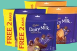
Cadbury Dairy Milk Assorted 150g - 180g BUY 2 @ RM17 00