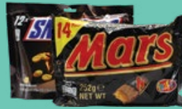
Mars/Snickers/M&M Assorted 202.5g - 252g BUY 2 @ RM20 00