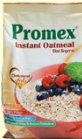
Promex Instant Oatmeal 800g