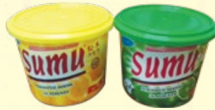
Sumu Dishwash Paste 800g