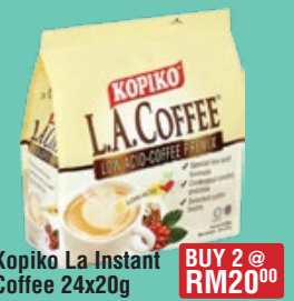
Kopiko La Instant Coffee 24x20g BUY 2 @ RM20 00