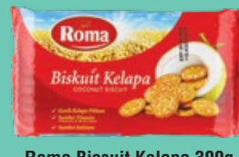
Roma Biskuit Kelapa 300g BUY 2 @ RM5 00