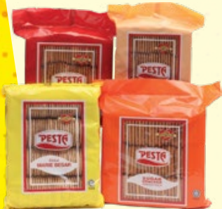
Pesta Biscuits & Crackers Assorted 800g - 900g