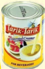
Tarik-Tarik Evaporated Creamer 390g