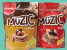
Munchy's Muzic Wafer Assorted 150g - 180g BUY 2 @ RM9 00