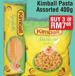
Kimball Pasta Assorted 400g BUY 3 @ RM7 00