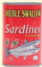
Double Swallow Sardines 425g