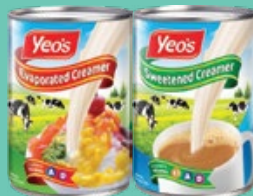
Yeo's Sweetened/Evaporated Creamer 390g - 500g BUY 2 @ RM4 00