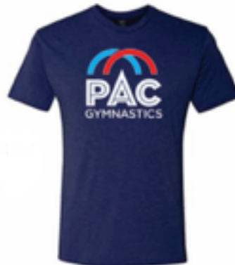
Vintage Navy Tri-Blend Tee $20 Youth Small-Adult 3X