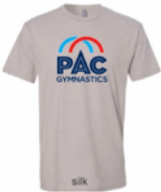
Silk Tri-Blend Tee $20 Adult Small-Adult 3X