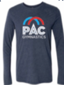
Washed Denim Long Sleeve $28 Adult Small-Adult 3X