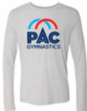
Heather White Long Sleeve $28 Adult Small-Adult 3X