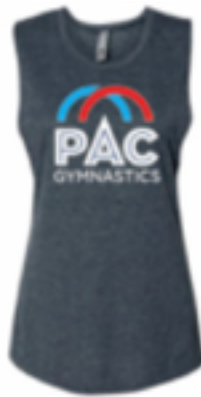
Washed Denim Tank $24 Adult Small-Adult 3X