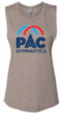
Ash Tank $24 Adult Small-Adult 3X