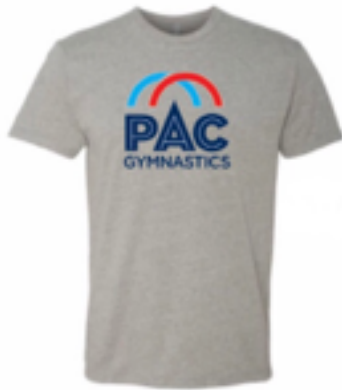
Ash Tri-Blend Tee $20 Youth Small-Adult 3X